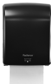
#RBDP1 Manual High Capacity Roll Towel Dispenser