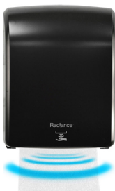
#RBDP2 Hands-Free High Capacity Roll Towel Dispenser